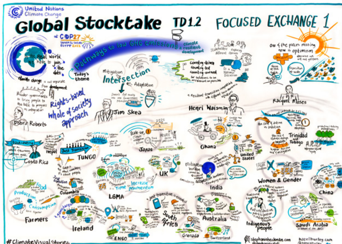
Figure 1: The only mention of international cooperation on TD artwork